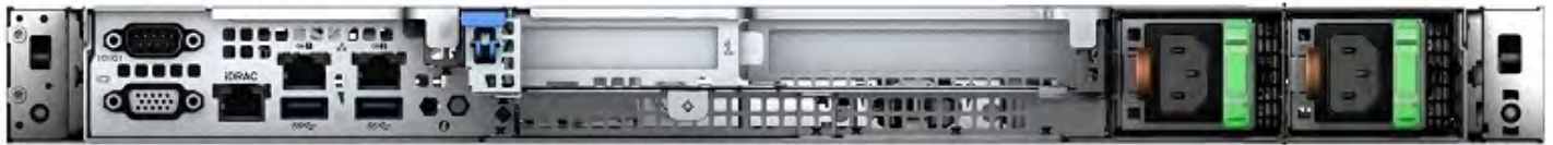
IP200 Model is Shown